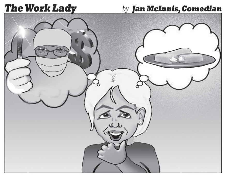
The latest plastic surgery for women is rear-end implants! If you're thinking of doing it, it costs $5000 dollars. A box of Twinkies is three bucks. ©2015

Dogs sleep just as much as cats, but because they are so happy to see you when you come home, with all their jumping and tail wagging and panting, it just appears that they are more active. They